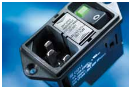
Figure 2: DC / DD series with recessed switch

SCHURTER has covered the ergonomic aspects such as switching state indication, the prevention of inadvertent actuation or user-friendly access, in different product lines. SCHURTER's DC and DD lines feature recessed switches preventing inadvertent actuation using a projecting protective collar (fig. 2). This product line also offers several illumination options for switching state indication.