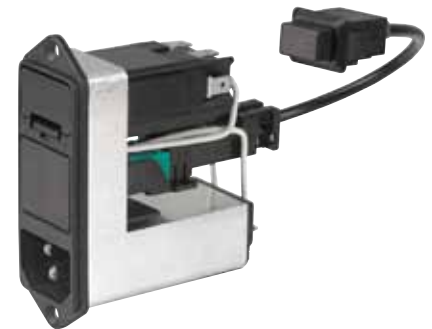
Figure 3: Switch with remote controlled actuation (bowden cable)

The IEC appliance inlets are generally mounted on a device's rear, while the controls are placed on the front. For this task, too, SCHURTER has an appropriate solution: a switch at the inlet that can be actuated mechanically from the front by a bowden cable (fig. 3). One of this solution's distinguishing characteristics is that it is immune to electric interference; at the same time, it represents the zero-current standby solution. Fuse drawer and bowden cable have to be ordered separately.