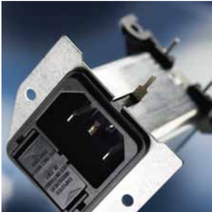
Figure 4: DA22, power entry module for PCB mounting