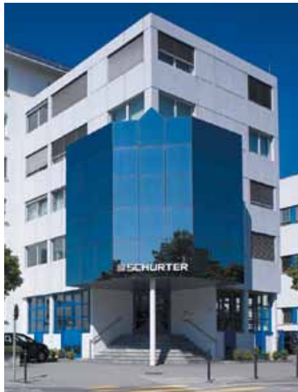
Headquarters in Lucerne

The great variety of different IEC appliance inlet models featuring switches and other functions allow manufacturers to develop solutions adapted to individual requirements in the most diverse of application areas. Hence, SCHURTER's products ensure ease of use combined with absolutely safe power input and the possibility to deliberately disconnect the power.