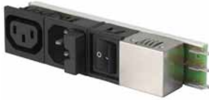
Figure 5: FELCOM with very low mounting depth

In many applications, the space dedicated to the power input is highly restricted. The panel cutout dimensions, the space required on the PCB as well as the available depth represent major selection criteria. SCHURTER's FELCOM line combines a very low mounting depth with great flexibility in terms of extra functions (fig. 5). In addition to the IEC connector and the line switch, fuse holders, distribution units and line filters are modularly configurable. Features such as circuit breakers or voltage selectors are available in other product lines.